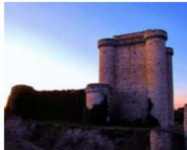
>>SESEÑA Castle Puñonrostro