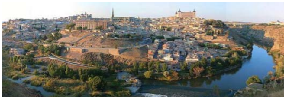
>>TOLEDO Panoramic View of the town

Find here ideas of the many wonderful things to do and enjoy around the site while your visit. Don't waste the opportunity to get to know some of the bests of the spanish culture.