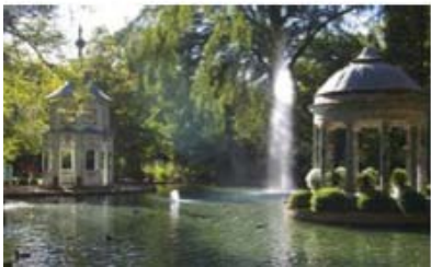
>>ARANJUEZ Royal Palace Gardens