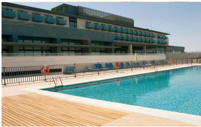
>>BARCELO HOTEL Outdoor pool