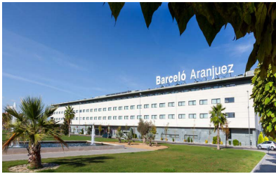
>>BARCELO HOTEL The Hotel