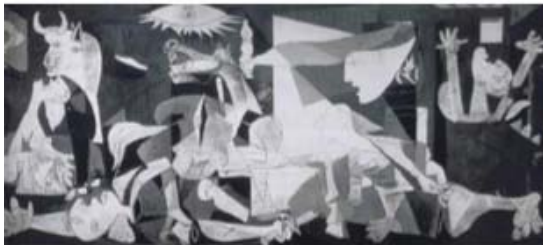
>>MADRID Guernica . Picasso