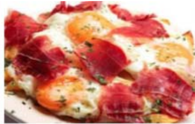
>>MADRID Tapas Food