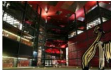
>>MADRID Reina Sofia Museum