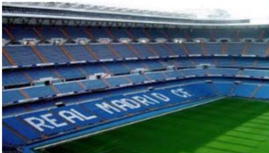
>>MADRID Real Madrid Stadium