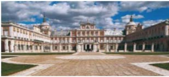
>>ARANJUEZ Royal Palace