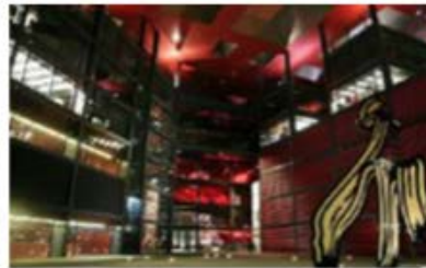
>>MADRID Reina Sofia Museum