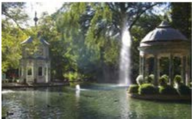
>>ARANJUEZ Royal Palace Gardens