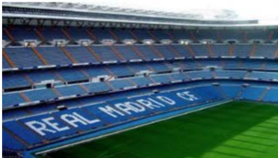
>>MADRID Real Madrid Stadium