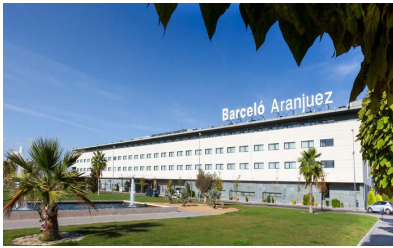
>>BARCELO HOTEL The Hotel