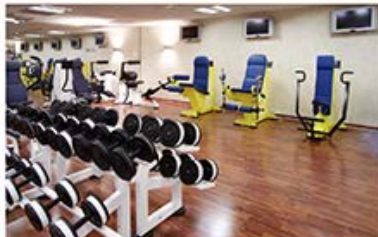
>>OCCIDENTAL HOTEL Gym