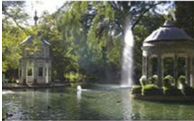
>>ARANJUEZ Royal Palace Gardens