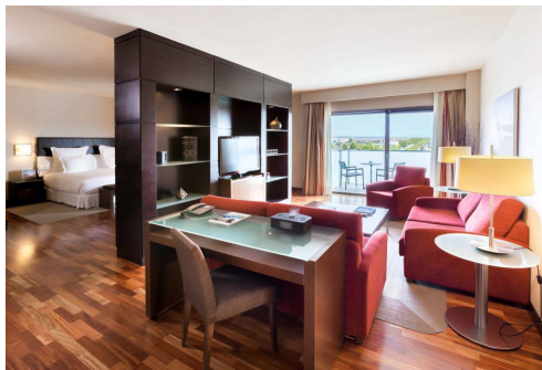
>>OCCIDENTAL HOTEL Bedroom