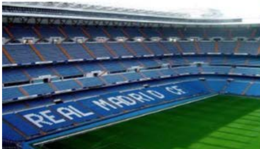
>> MADRID Real Madrid Stadium