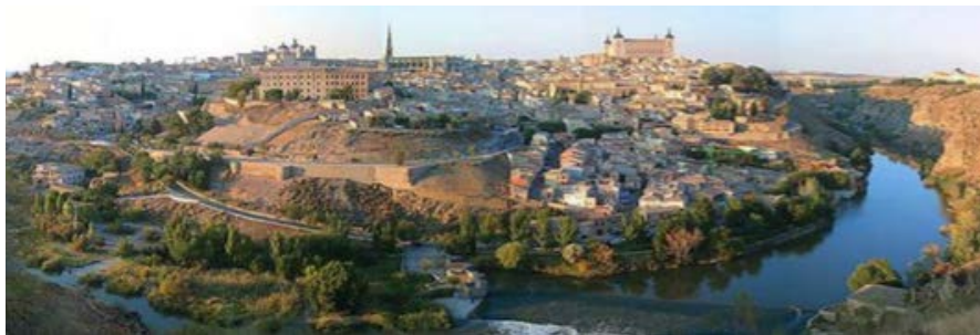
>>TOLEDO Panoramic View of the town

Find here ideas of the many wonderful things to do and enjoy around the site while your visit. Don't waste the opportunity to get to know some of the bests of the spanish culture.