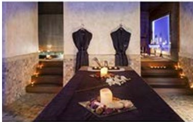
>>OCCIDENTAL HOTEL Massage area