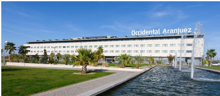
>>OCCIDENTAL HOTEL The Hotel

Credit Cards accepted: Visa, MasterCard, American Express and Eurocard.