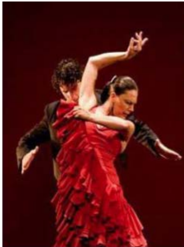
>> MADRID Flamenco