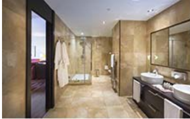
>>OCCIDENTAL HOTEL Bedroom