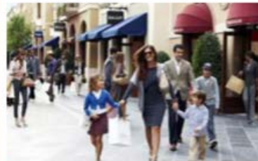
>> MADRID Shopping