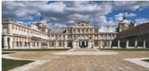
>>ARANJUEZ Royal Palace