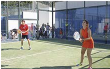
>>OCCIDENTAL HOTEL Padel Court