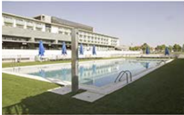
>>OCCIDENTAL HOTEL Outdoor pool