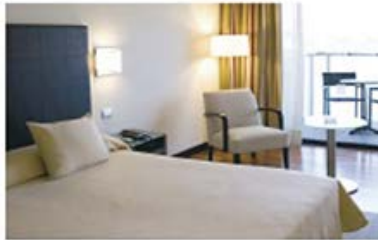
>>OCCIDENTAL HOTEL Bedroom