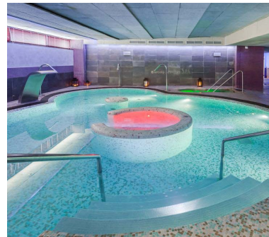
>>OCCIDENTAL HOTEL Spa area