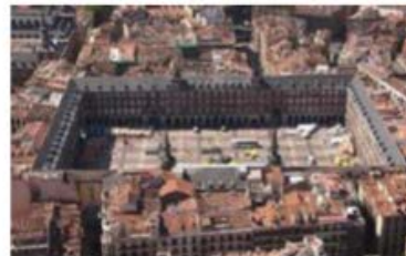
>> MADRID Downtown