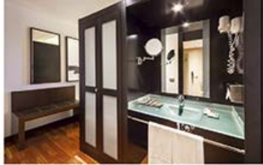
>>OCCIDENTAL HOTEL Bedroom