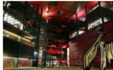
>> MADRID Reina Sofia Museum